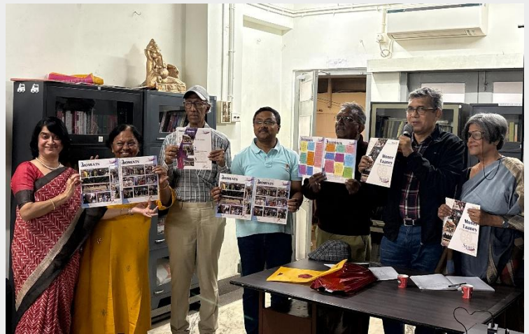
Unfurling of Special edition of Spark on Moner Taaney Mela 31 st Jan'24